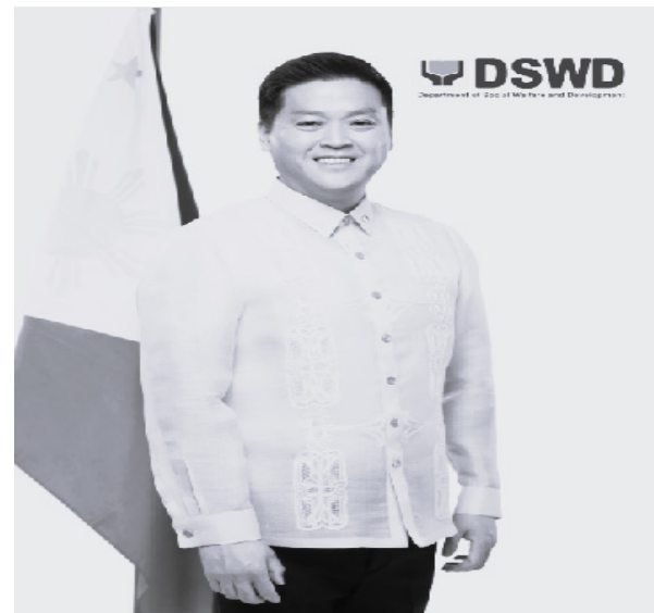
DSWD Secretary Rex Gatchalian's Official Photo